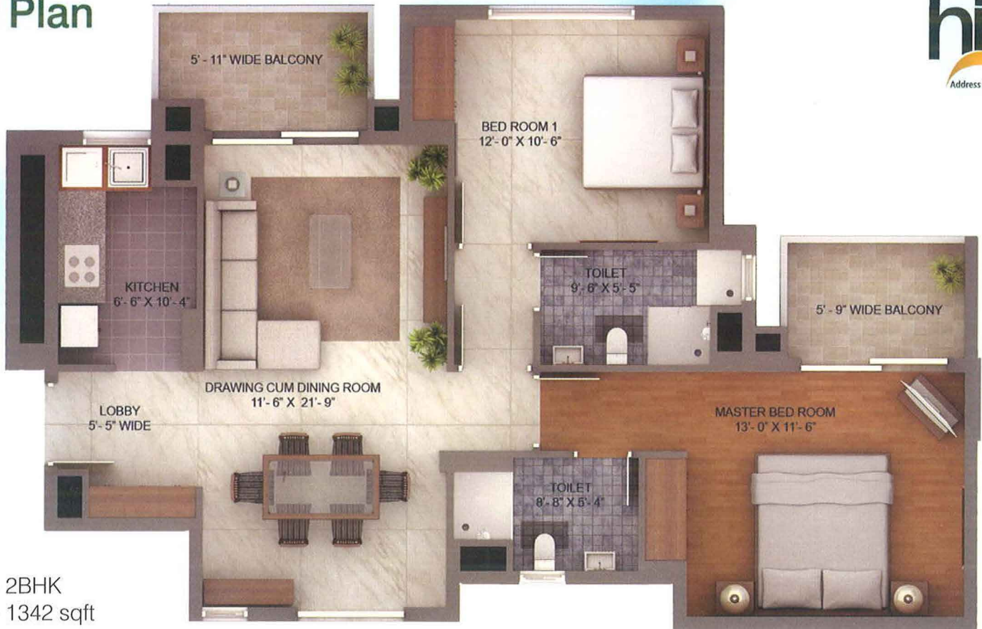
Type - 2BHK Area - 1342 sqft