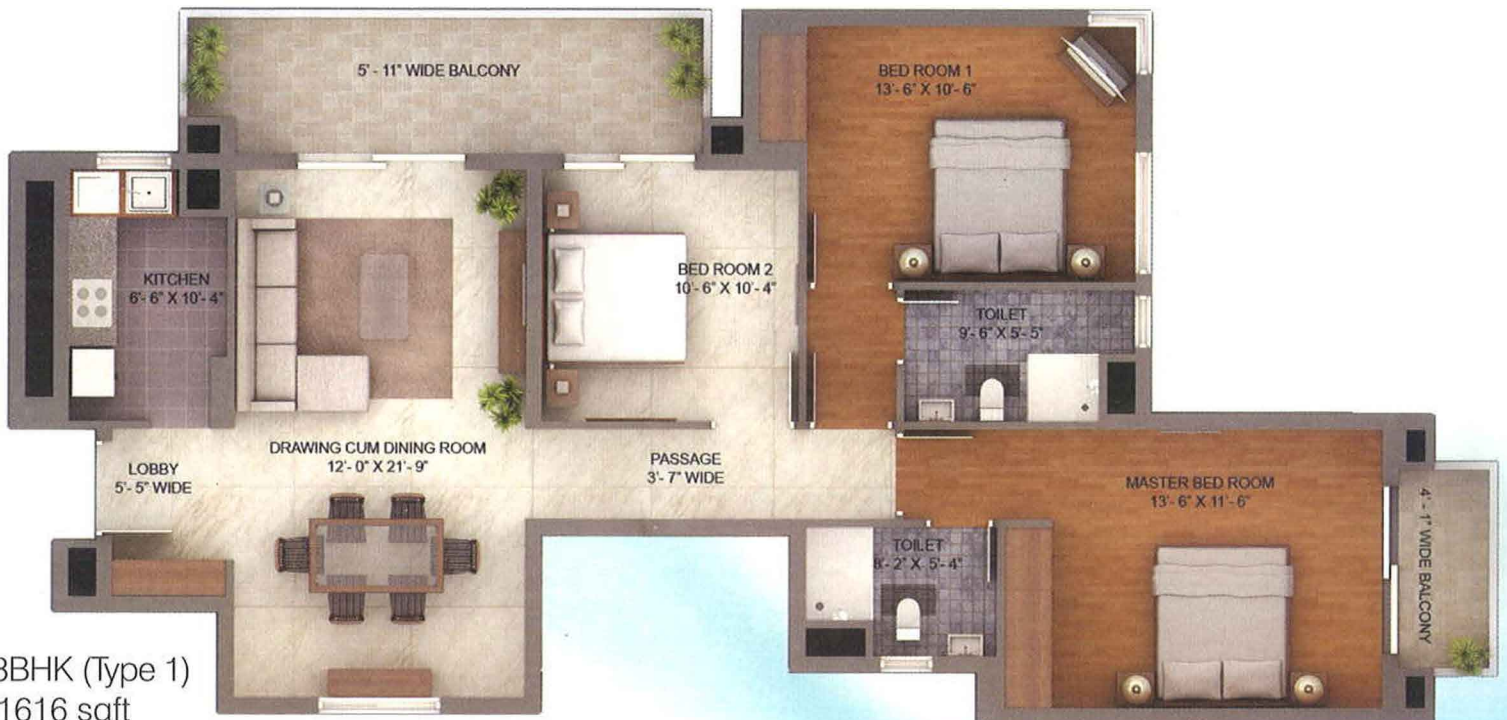
Type - 3BHK (Type 1) Area - 1616 sqft